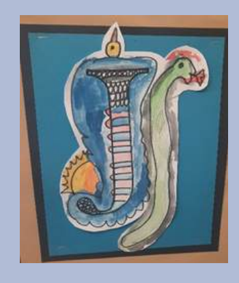
Illuminated letter by Jobe (Y3)