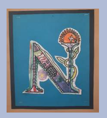
Illuminated letter by Nieve (Y3)

Please admire the detail, care and attention which is displayed here in these examples: